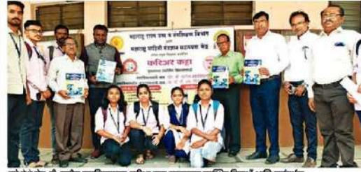
पुणे येथे डेड. बी. पाटील महाविद्यालयात करिअर कट्टा उपक्रमात उपस्थित विद्यार्थी आणि मार्गदर्शक