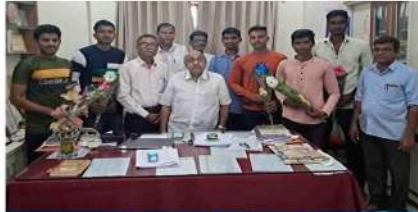
निवड झालेले विद्यार्थी